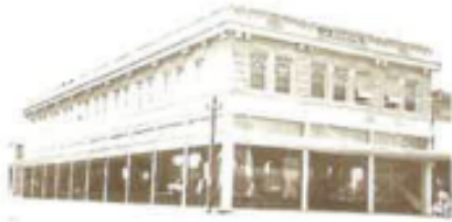
JA Mahoney Building