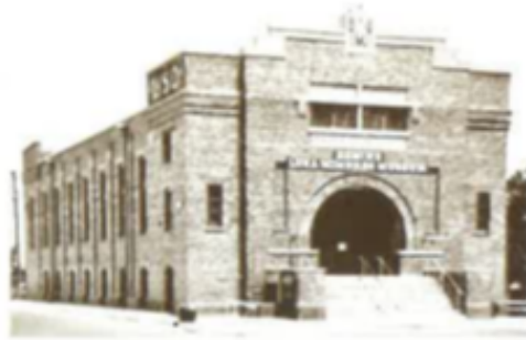
Deming Luna County Mimbres Museum